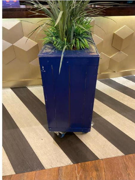
Planter box -

32 inches Tall 39.5 Inches wide 15.5 inches deep