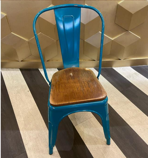
Chairs in various colours (Blue, Pink, White, Grey)