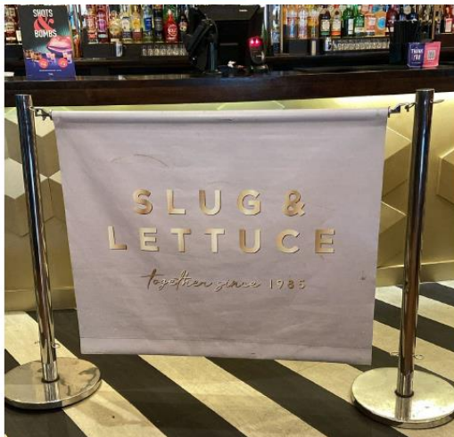
Café barrier / wind breaker

32 inches Tall 39.5 Inches wide 15.5 inches deep