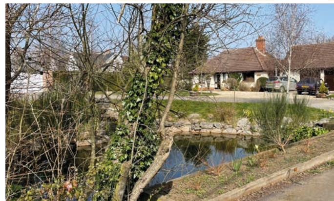
Typical housing along Domsey Lane