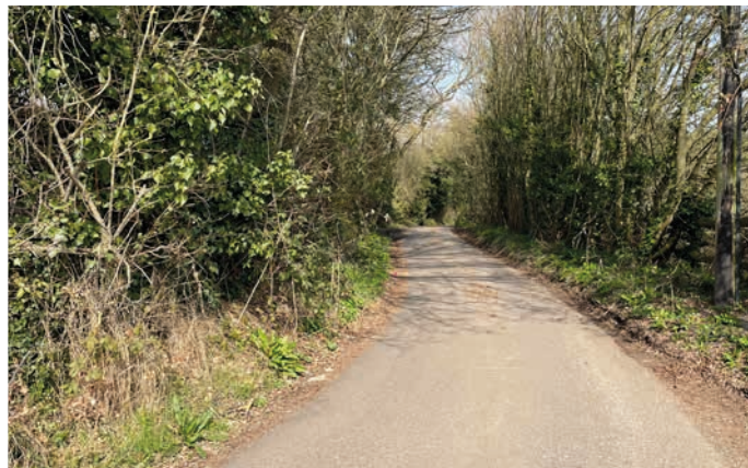
General character of Domsey Lane