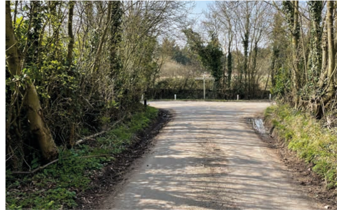
Domsey Lane junction with Pratt's Farm

In order to maintain access to Domsey Lane during construction, works will be sequenced or arranged in order to ensure that in order to ensure that all users will maintain the ability to access or exist the lane. The details of this will be secured within a detailed Construction Management Plan.