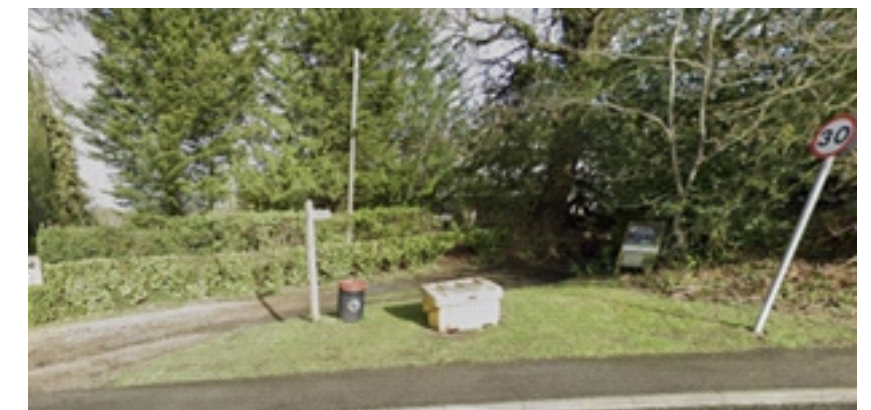
Figs.29 and 30 Green spaces

Two small green spaces flank the road adjacent to Wood Haven and Cock Farm. At Wood Haven there is a public footpath post and sign, bin, grit bin, 30mph speed sign and post, as well as a sign for Heather Hills nature reserve. These features could be rationalised. At Cock Farm there is a low railing on concrete posts which could be improved or redecorated.