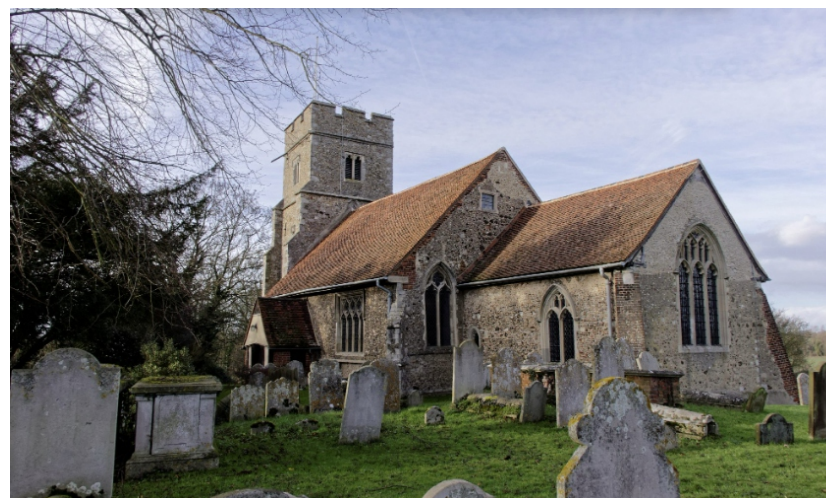
Fig. 3 St Marys Church

Mary's Church, each dating from the Stone Age. Parts of axe heads and sickle blades found near Chapel Lane and New Lodge Chase date from the Bronze Age. There is an iron age earthwork at Heather Hills, east of North Hill. Within the Chelmer valley to the north are a number of cropmarks indicating ring ditches, rectangular and irregular enclosures, as well as historic field boundaries. These are of various dates, but include Bronze Age features. A Roman coin was found at Graces Walk and re-used Roman materials are present at St Marys Church.