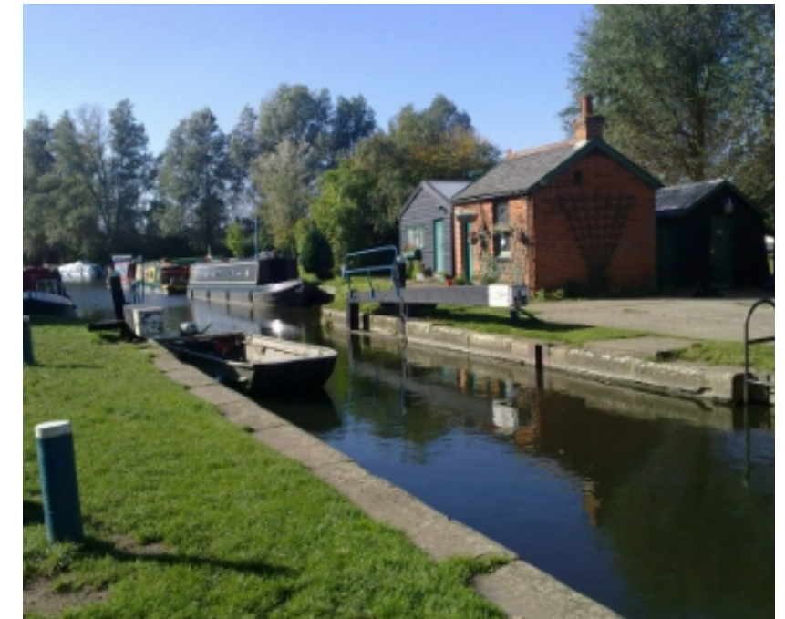
Fig. 1 Paper Mill Lock, within the Chelmer and Blackwater Navigation Conservation Area

Scheduled Monuments. The Chelmer and Blackwater Navigation Conservation Area between Chelmsford and Heybridge runs through the northern part of the parish. There is currently no other Conservation Area within the parish.