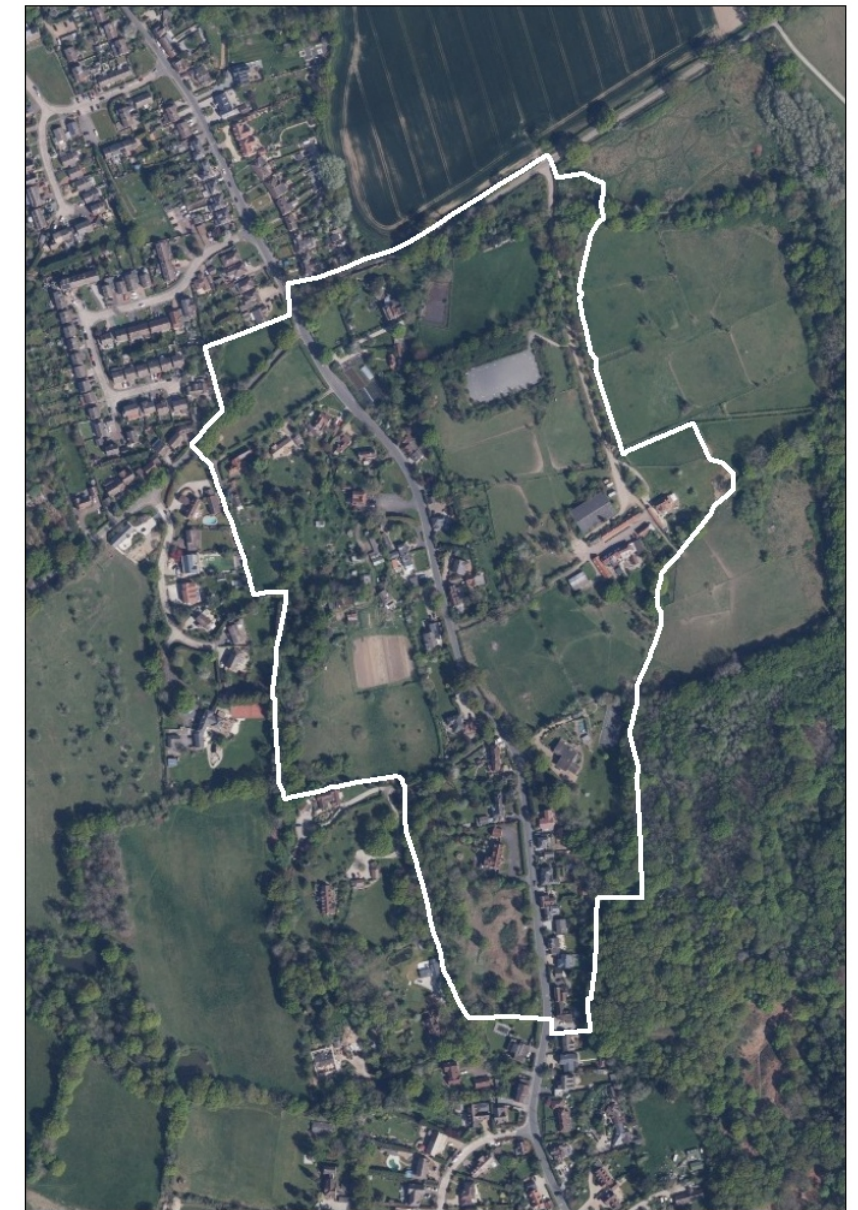
Fig. 26 Aerial view of proposed Conservation Area

To both the east and west the rural landscape extends further, but there is a need to provide a boundary which includes the land which makes the greatest contribution to the character of the area, defined by logical features on the ground.