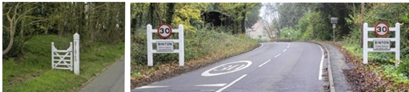
Figs 27 and 28 Village gateway examples

Little Baddow has no notable village gateways at present, as are found at other historic Essex villages. There could be a gateway to North Hill and/or the parish itself to reinforce legibility and local distinctiveness, as well as providing traffic calming.