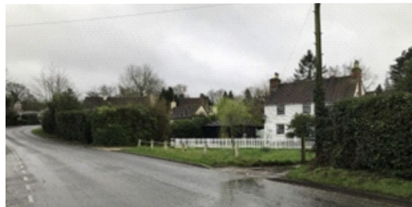
Fig.18 View towards Cock Farmhouse and beyond (winter)

Cock Farm, Pilgrims, Pledgers Cottage, Fern Cottage, The Rodney the adjacent cottages are a picturesque group of buildings within a landscape setting with a varied roofscape.