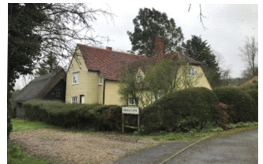
Fig.17 Pilgrims and its thatched barn, Gravy Lane leading down to North Hill

The North Hill area is characterised by deeply hemmed in country lanes of verdant character though with the added drama of an undulating hillside. There is a more coherent sense of community in the form of a closely spaced grouping of houses, organically and incidentally planned. The main views are those aligned with North Hill and Holybread Lane. From the northern part of the North Hill, the elevated views take in the varied and interesting roofscape of this part of the village. Gravy Lane and the area around Pilgrims adds to the distinct village character and is not undermined by the presence of more modern housing to the west (Rysley).