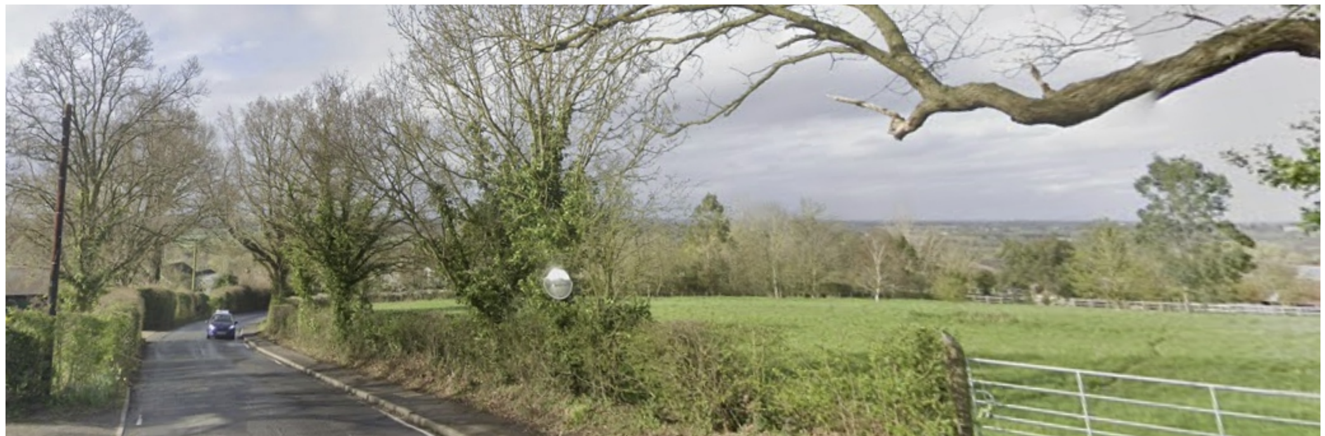
Fig. 31 North Hill native hedged boundary and trees

Conservation Areas provide limited control over unlisted buildings. They can be reinforced by Article 4 Directions which can be drafted to remove permitted development rights over such things as replacement front doors, windows, roof coverings, and external painting. These things do not at present seem to be a cause for concern in the Conservation Area. At present, such extra controls do not seem necessary, but could be considered as necessary in the future.