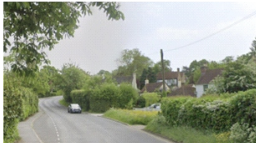
Fig.19 View towards Cock Farmhouse and beyond (summer)