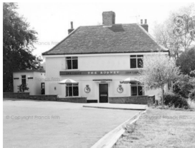
Fig. 11 The Rodney c.1960

The earliest building is Warren Farmhouse of the mid-sixteenth century. Pilgrims and The Rodney Inn both originate from the seventeenth century. They form part of a group with other eighteenth and early nineteenth century buildings at the northern end of North Hill, close to Holybread Lane to the south of what was Wickhay Common.