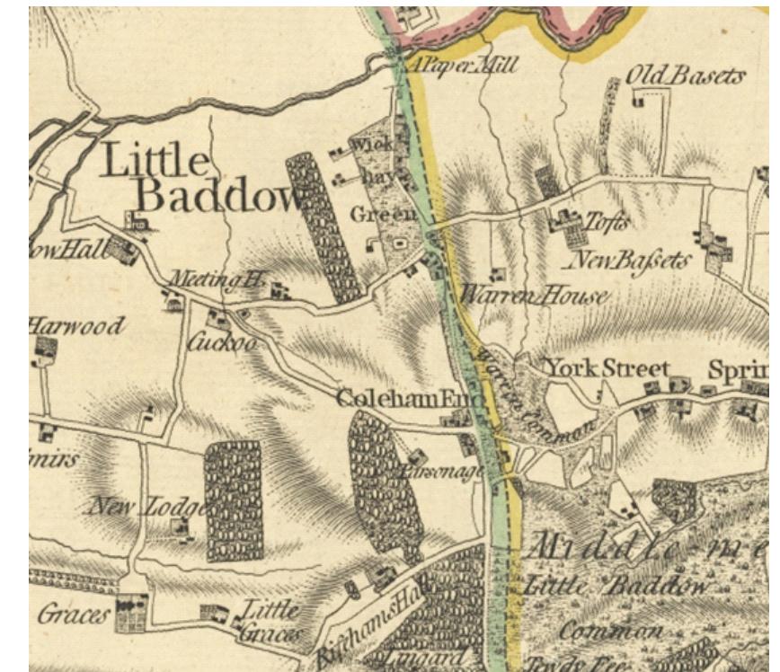
Fig. 4 Little Baddow from the 1777 Chapman and André map of Essex

The present Cock Farmhouse dates from the late eighteenth century, but is on an older site – beer was brewed there by 1475 and before 1614 there was an alehouse.