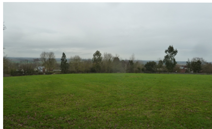
Fig. 12 View to Warren Farm

The route down North Hill gives views out over countryside across the valley. The sinuous form of North Hill means that views are everchanging – enclosed, then opening up, providing constant interest. The open field adjacent to Wood Haven provides extensive views to Warren Farm and across the valley.