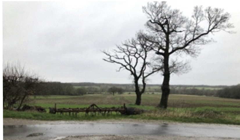
Fig. 15 View from Tofts Chase north over the Chelmer Valley towards the Chelmer and Blackwater Navigation.

Holybread Lane leads onto St Marys Church 1.3km to the west, a historically important route linking the dispersed village to the parish church. The first section of the lane within the identified area is narrow and enclosed by hedges, the adjacent fields providing a rural setting. There are glimpsed views toward Pilgrims and its thatched barn. Travelling east along the lane there are good views (particularly in winters months) toward Walters Cottage, its formal Georgian frontage and large garden provide some status.