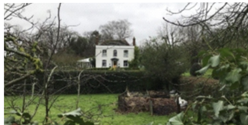
Fig.16 Walters Cottage set within extensive grounds

Holybread Lane leads onto St Marys Church 1.3km to the west, a historically important route linking the dispersed village to the parish church. The first section of the lane within the identified area is narrow and enclosed by hedges, the adjacent fields providing a rural setting. There are glimpsed views toward Pilgrims and its thatched barn. Travelling east along the lane there are good views (particularly in winters months) toward Walters Cottage, its formal Georgian frontage and large garden provide some status.