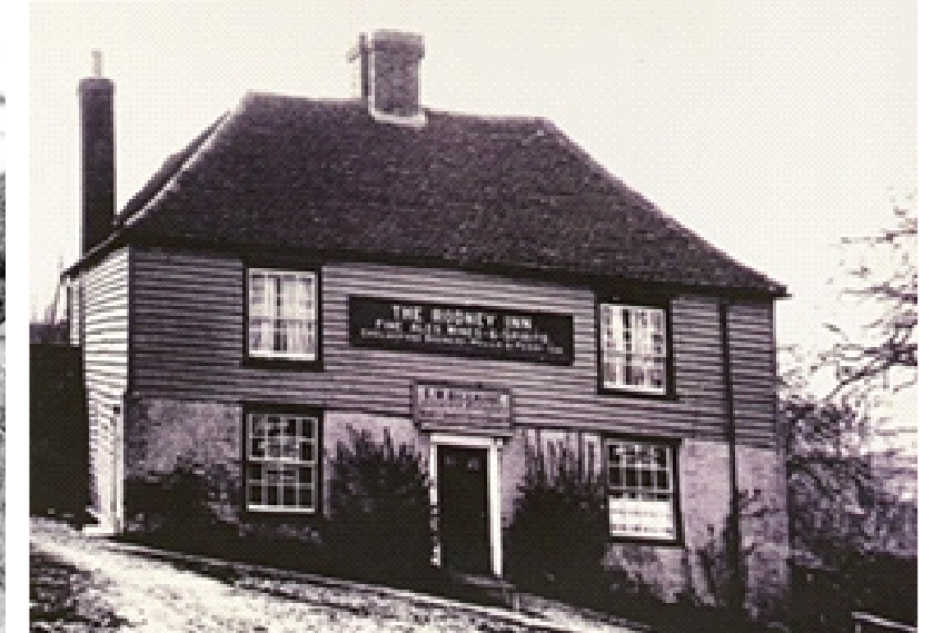
Figs. 8 and 9 View down North Hill from adjacent to the post office towards the school (now St Andrews) c.1960 and The Rodney Inn in the early twentieth century.