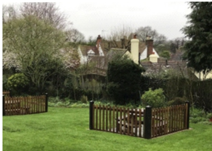
Fig.20 Cottage roofscape, looking north from the grounds of The Rodney