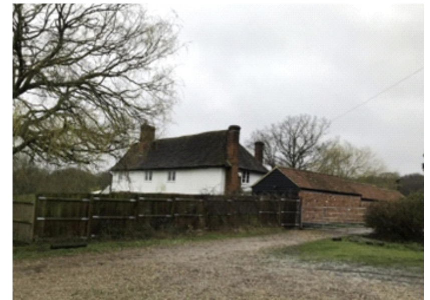
Fig. 25 Warren Farm viewed from the northwest.

On the east side, Warren Farm is approached by a narrow track opposite Lower Pightle. The group of modern and traditional farm buildings emerge in the distance set around a courtyard, with the mid-sixteenth century farmhouse beyond. To the north another track provides access via Tofts Chase. The land provides an important rural setting to North Hill and Warren Farm, including a sequence of fine views and a number of important trees.