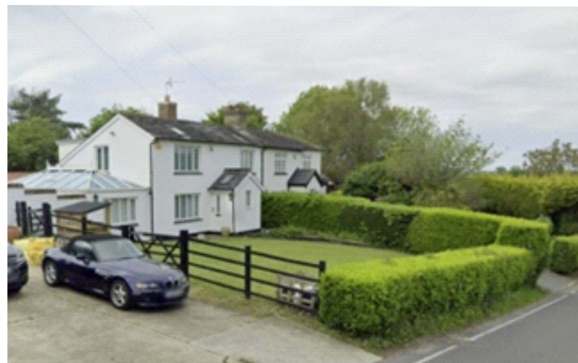
Fig.24 Hill Cottage and Florence Cottage Mid-nineteenth century.

57 North Hill acts as a focal point in the distance where North Hill turns. The former public house and shop set within a well treed setting.