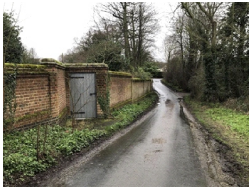
Fig.14 The view west along Tofts Chase, the garden wall to Little Walters and important trees.

Tofts Chase is an ancient lane leading on towards isolated farmsteads within a rural landscape. The first section is well defined by mature trees and the northern edge of the grounds to Walters Cottage, enclosed by a well detailed brick garden wall. Further east, expansive views open up across the river valley and down toward the Chelmer and Blackwater Navigation, an important feature of the rural setting.