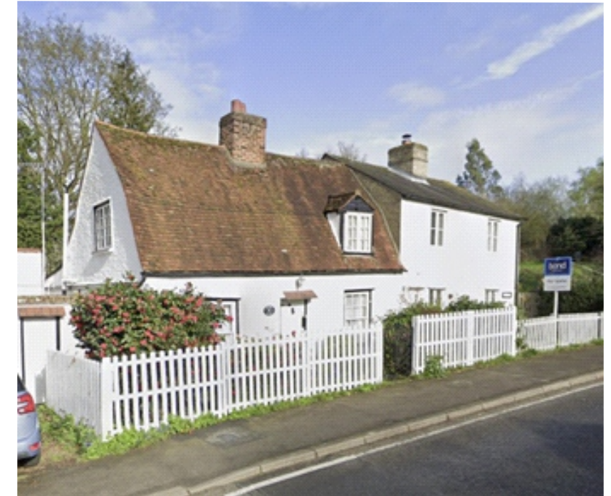
Fig. 10 57 North Hill and The Return. A Mixture of traditional materials and detailing. Both buildings had weatherboard in the past.

Windows are a mixture of sashes and casements, often divided into small panes with glazing bars. Painted timber windows are common, but there are some UPVC replacements. Windows are often sheltered by sloping timber pentice boards to their heads.