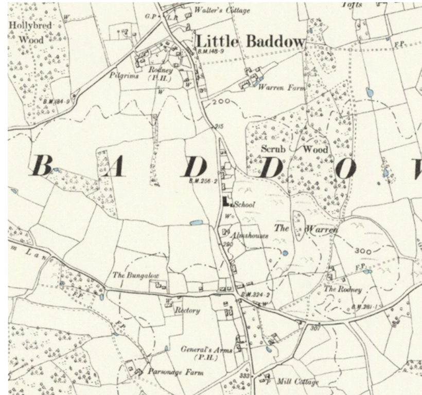
Fig. 5 Second Edition Ordnance Survey Map, surveyed 1895, published 1897.

point between Chelmsford and Heybridge, with the bargemen sleeping in the Bothy and stabling provided for their horses. Since commercial traffic ended in the 1970s, the canal opened for pleasure craft and is a popular visitor destination.