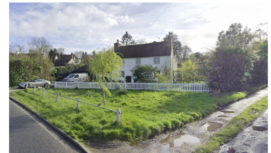
Fig. 13 Cock Farm

The road junctions and the green verge adjacent to Cock Farm, Wood Haven and The Rodney provide minor focal points.