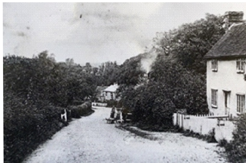
Fig.22 Warren Cottage, historic view down North Hill

Further north, there is a group of cottages again of varied character. The slope downhill provides an interesting roofscape and distinctive views. The meandering form of the road and hedged boundaries play an important role in providing interest and enclosure, reinforcing the rural character.