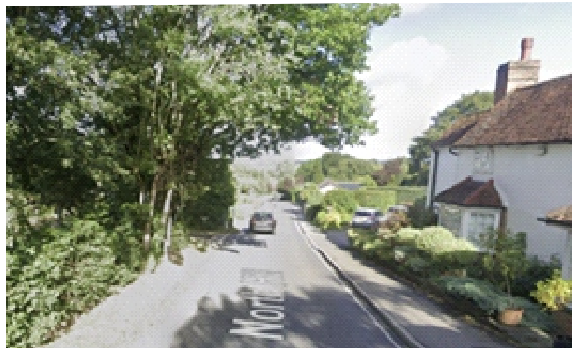
Fig.23 Warren Cottage, recent view compare to figure 22.