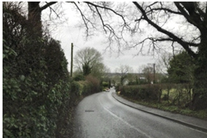
Fig.21 View north along North Hill, in the vicinity of The Ridings

The rising topography allows far reaching views to the north as one descends North Hill, notably alongside the expanse of open farmland at Warren Farm (Figure 12). A bench has been placed in a position in this vicinity where the vista can be taken in and appreciated at leisure.