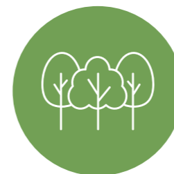
Chelmsford Garden Community – a design exemplar in the National Design Guide

Alongside the existing offer, Chelmsford is a hub of new communities, with various housing projects already completed and others well underway. A new community of around 10,000 new homes is shaping the future growth of Chelmsford within the Chelmsford Garden Community – a development which has already been recognised as a design exemplar in the National Design Guide.