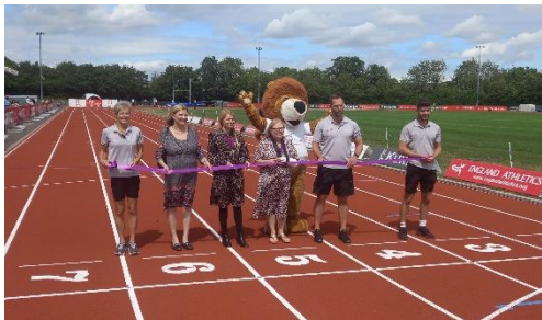
Later the same day the Deputy Mayor and Deputy Mayoress paid a visit to Chelmsford Sports and Athletics Centre where they were shown around before cutting the ribbon to open the new running track. They stayed on to enjoyed watching some of the England Athletics Championships.