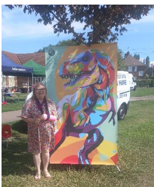
The Deputy Mayor dropped into Melbourne Park to meet families who were there for Picnic in the Park. The children were involved in themed activities throughout the week and today it was dinosaurs. Fortunately, the weather was good, and it was a big success with everyone.