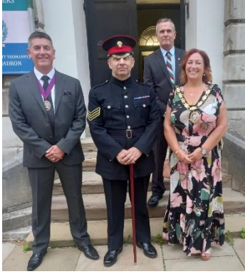
The Mayor and Consort were privileged to attend the 71st (City of London) Yeomanry Signal Regimental reception at Lincoln's Inn Arc.