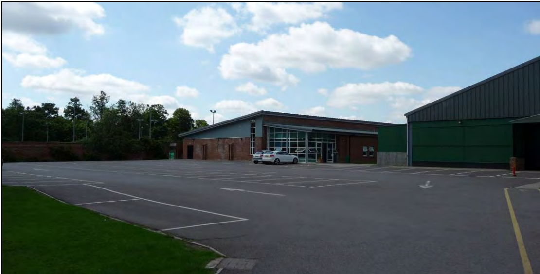
Photograph 2 – view of modern sports buildings within walled garden in W of school site