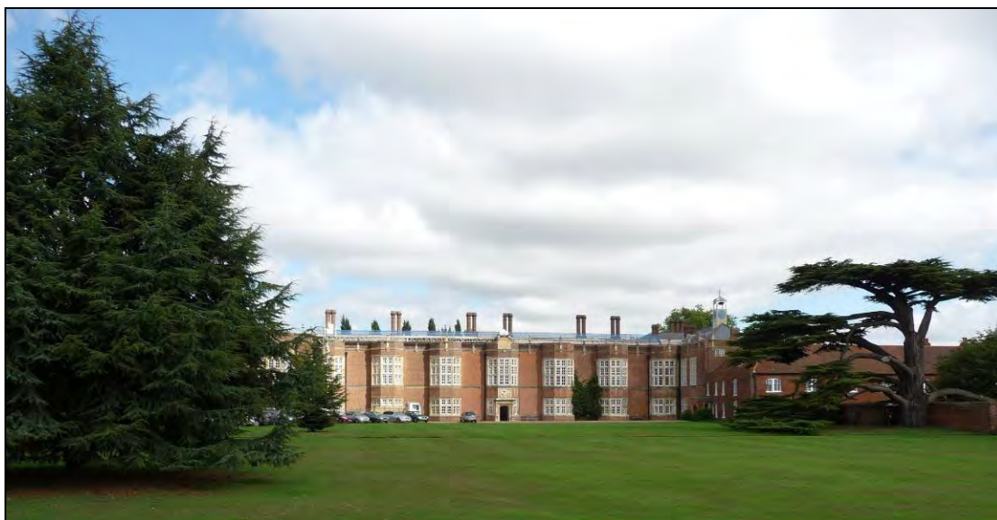
Photograph 3 – view of S front of New Hall