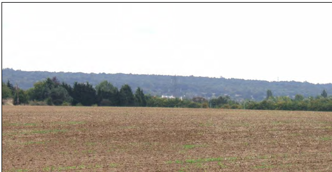
Photograph 4 – view of Boreham House rooftop from eastern front Garden wall of New Hall