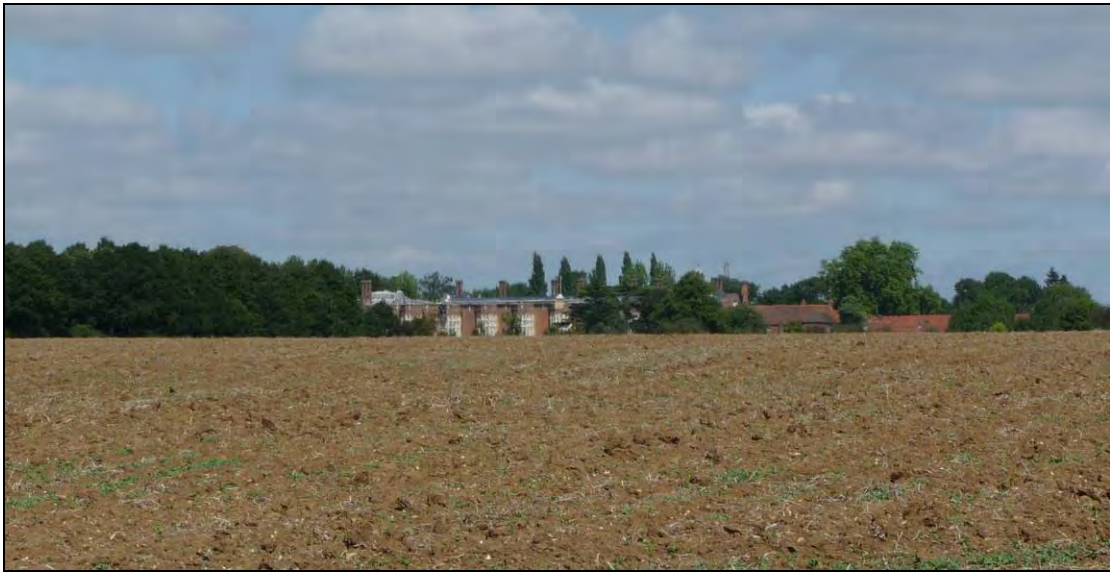
Photograph 1 – close up of view 10 (fig.1)