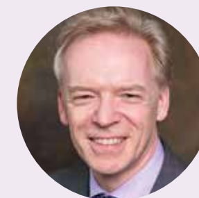
Councillor Stephen Robinson Leader of the Council

Our ambition remains for Chelmsford to be recognised as a leading regional centre, leading by example and helping to make our society safer, greener, fairer, and better connected. We believe that Our Plan will help make these ambitions a reality, whilst recognising that we will need to remain flexible and responsive if we are to continually adapt to an ever changing social, economic and environmental landscape.