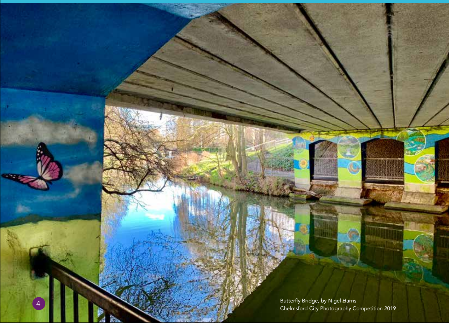
Butterfly Bridge, by Nigel Harris Chelmsford City Photography Competition 2019