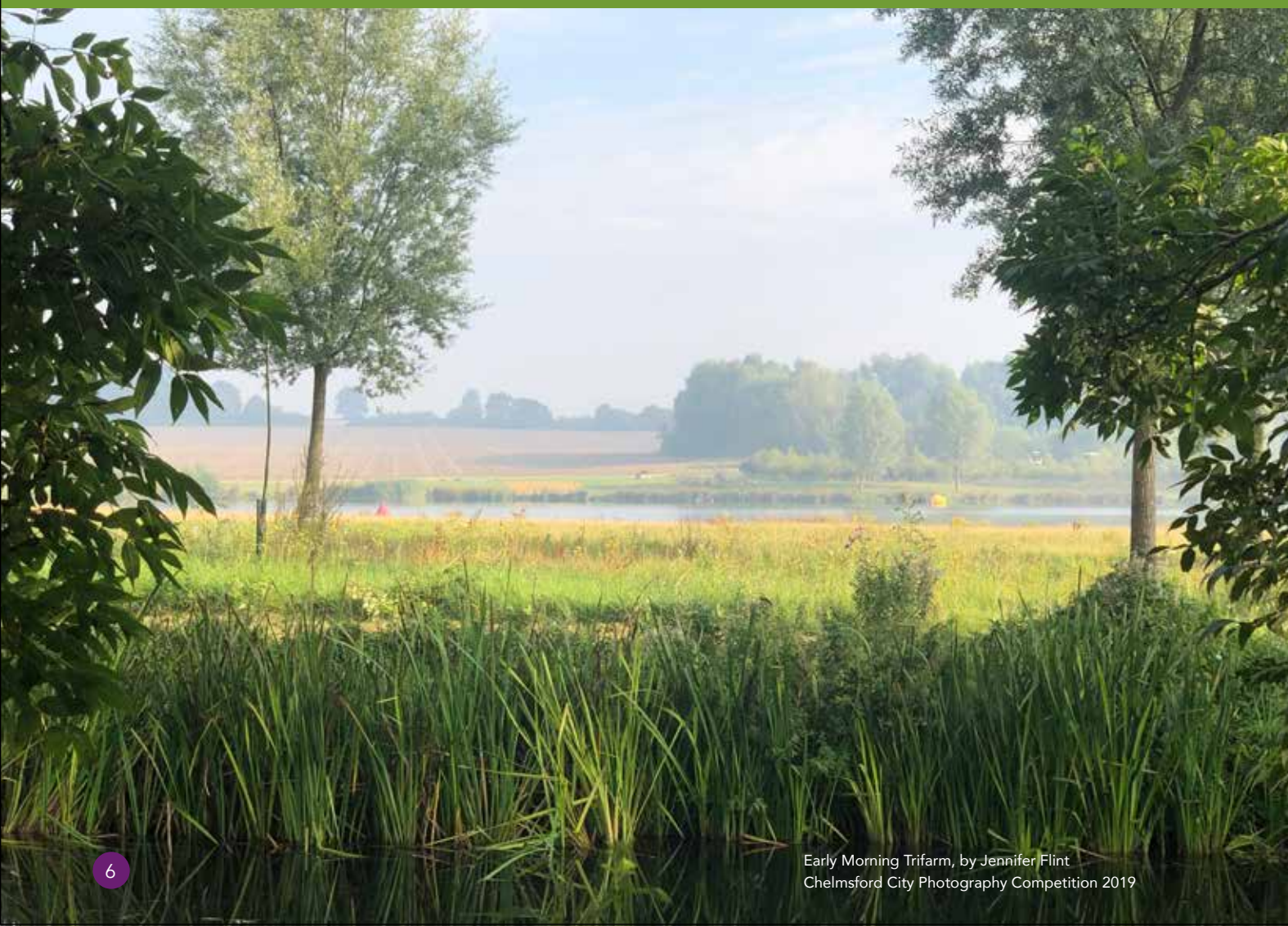
Early Morning Trifarm, by Jennifer Flint Chelmsford City Photography Competition 2019