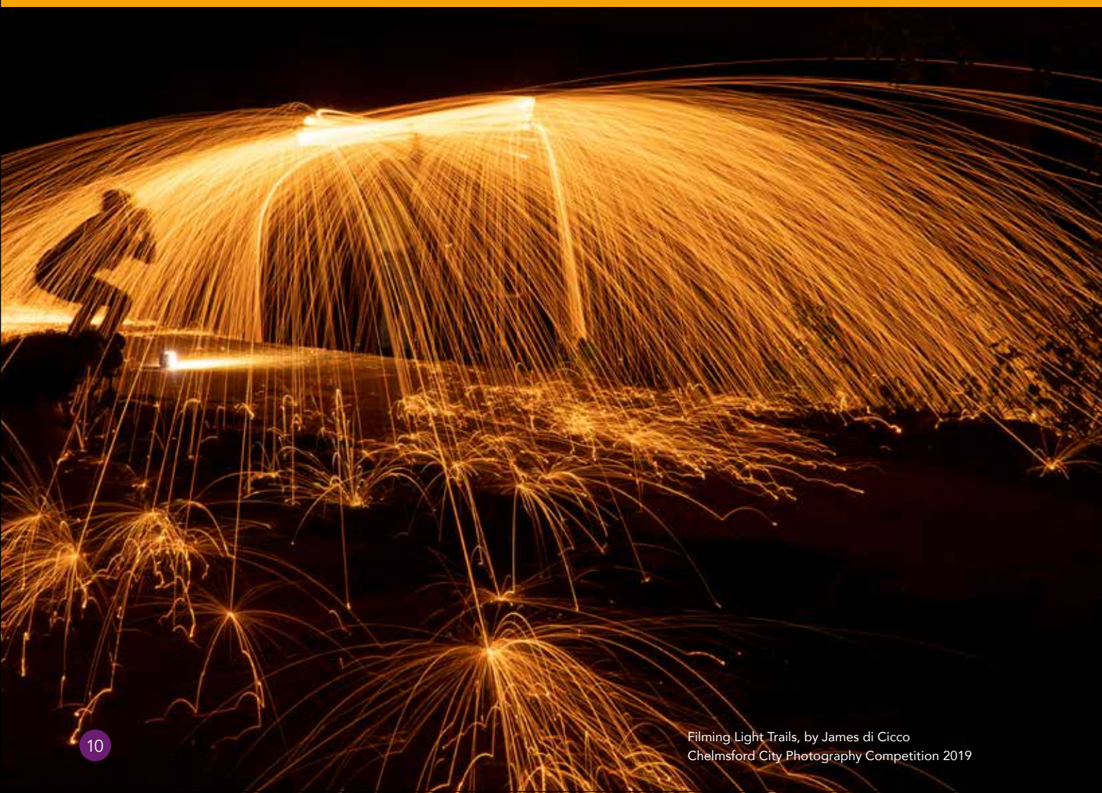
Filming Light Trails, by James di Cicco Chelmsford City Photography Competition 2019