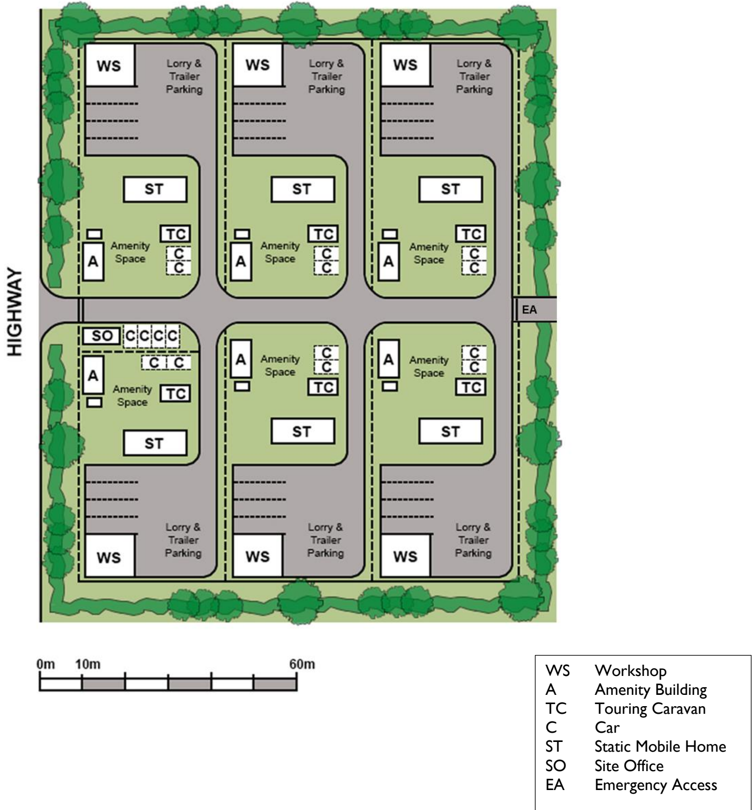
Figure I: Indicative Travelling Showperson site example layout with separate provisions