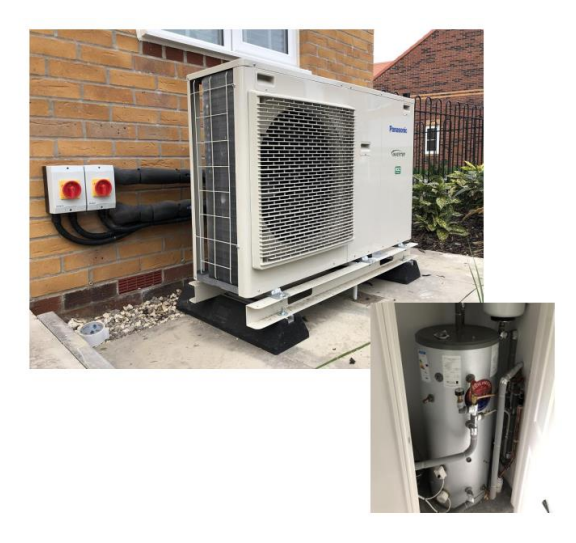
FIGURE 6: HEAT PUMP INSTALLATION