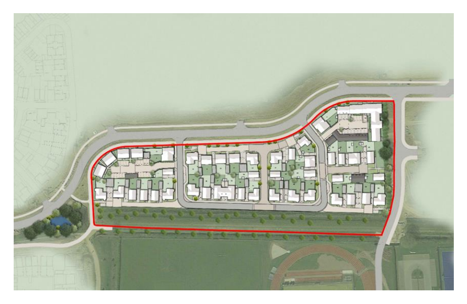
FIGURE 5: SITE PLAN - ZONE T